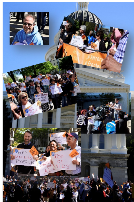
CFT march on Sacramento to prevent deportation of students and families